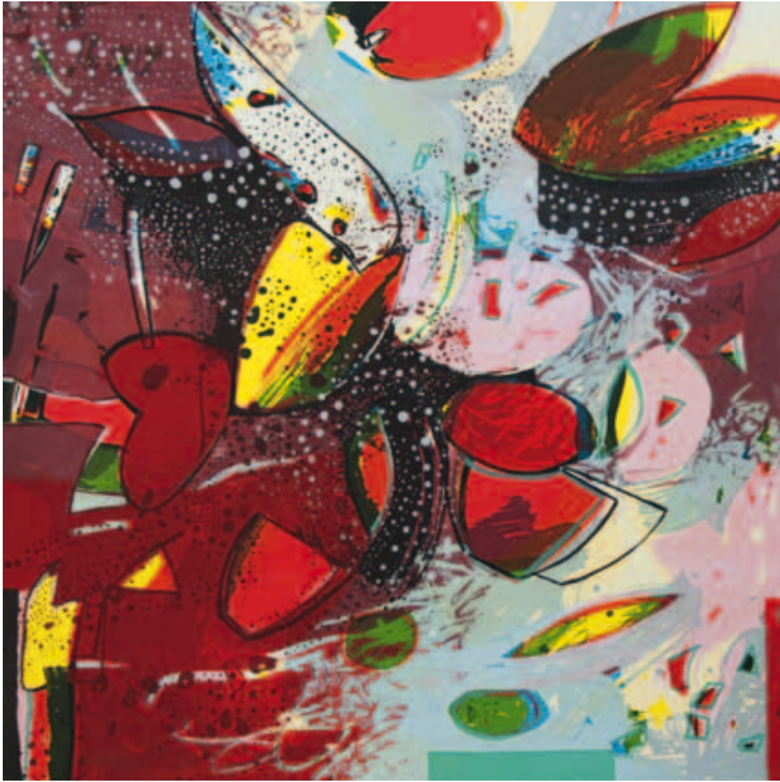
Pieter Vermeulen Dansend vierkant (zeefdruk - 60 x 60 cm)