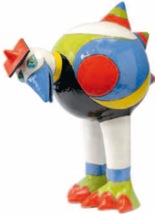
Ineke Schippers Parkeerwachter (steengoesd - 45 x 40 x 20 cm)