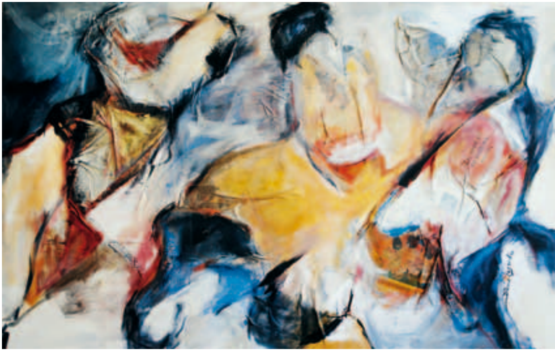
Dianne Lugard Zet 'm op (acryl op doek en kranten - 100 x 160 cm)