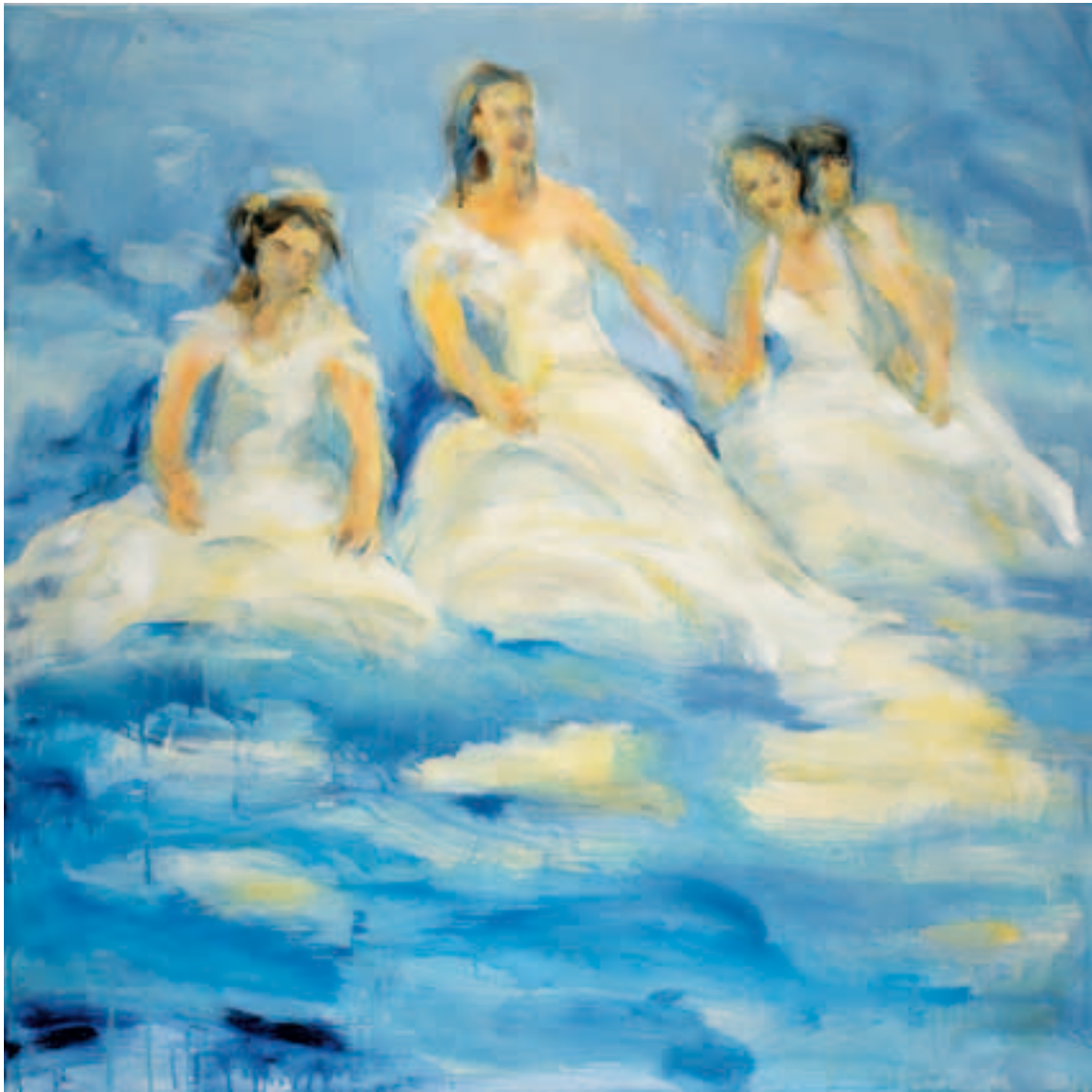
Frida Stad Bruiden in zee (acryl op doek - 100 x 100 cm)