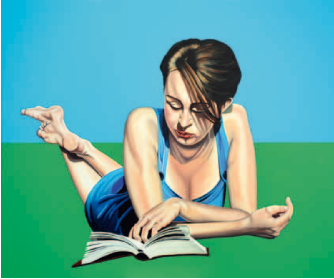
Yvonne van Woggelum Het boek (acryl op linnen - 100 x 120 cm)