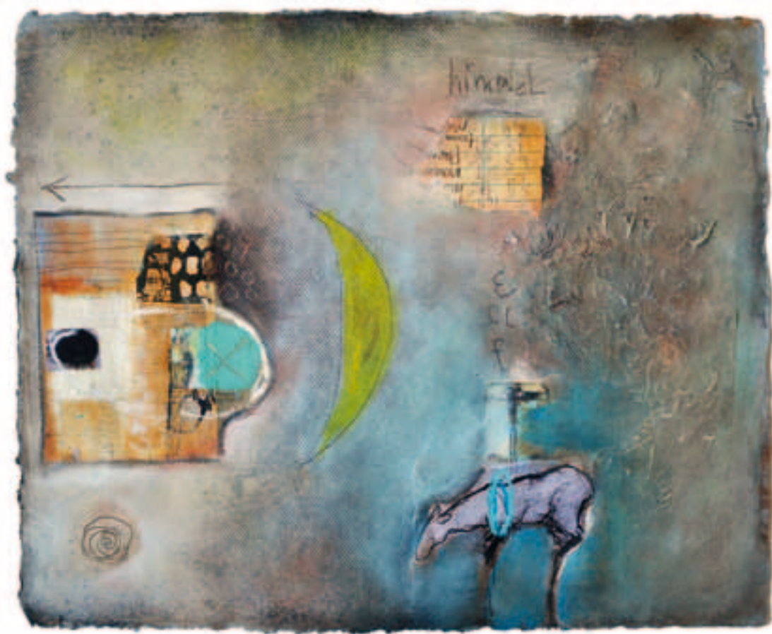
Thea Vos Zonder titel (werk op Zaansh bordpapier, gemengde techniek - 30 x 40 cm)