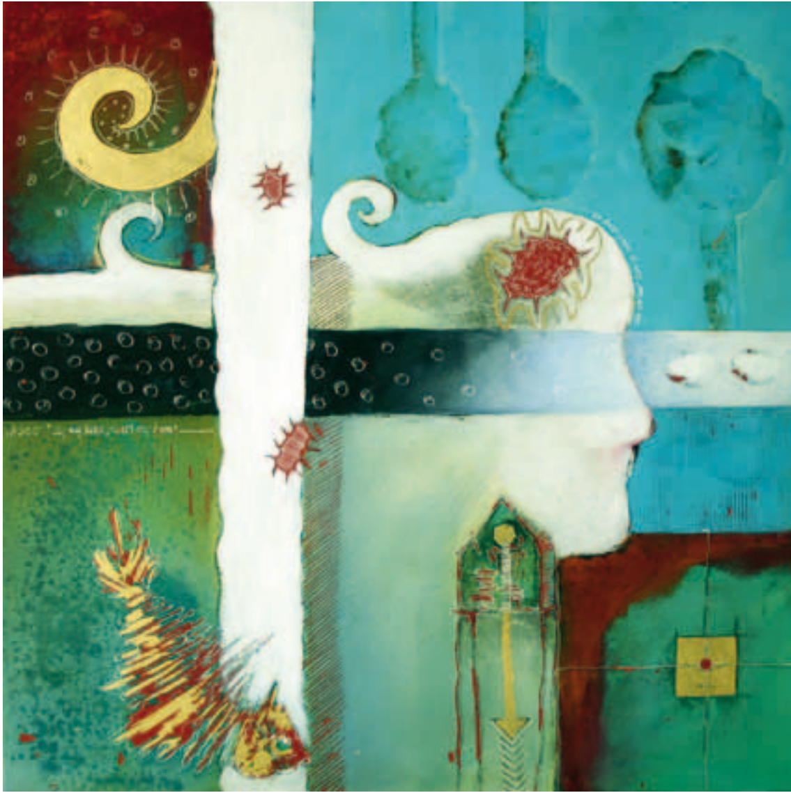
Ingeborg Leeffink Kunsttafel, wherever I lay my head..., (acryl op hout, tafeltje - 56 x 56 x 46 cm)

1 _____ 2 _____ 3 _____ 4 _____ 5 _____ 6 _____ 7 _____ 8 _____ 9 _____ 10 _____ 11 _____