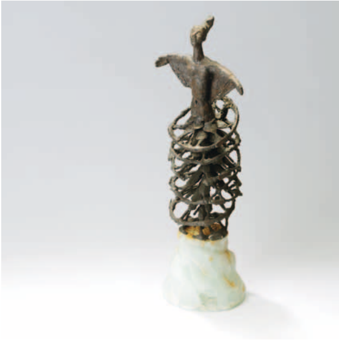
Hanneke van den Bergh Dennenappelnimf II (brons op gecast glas - 30 x 12 x 8 cm)