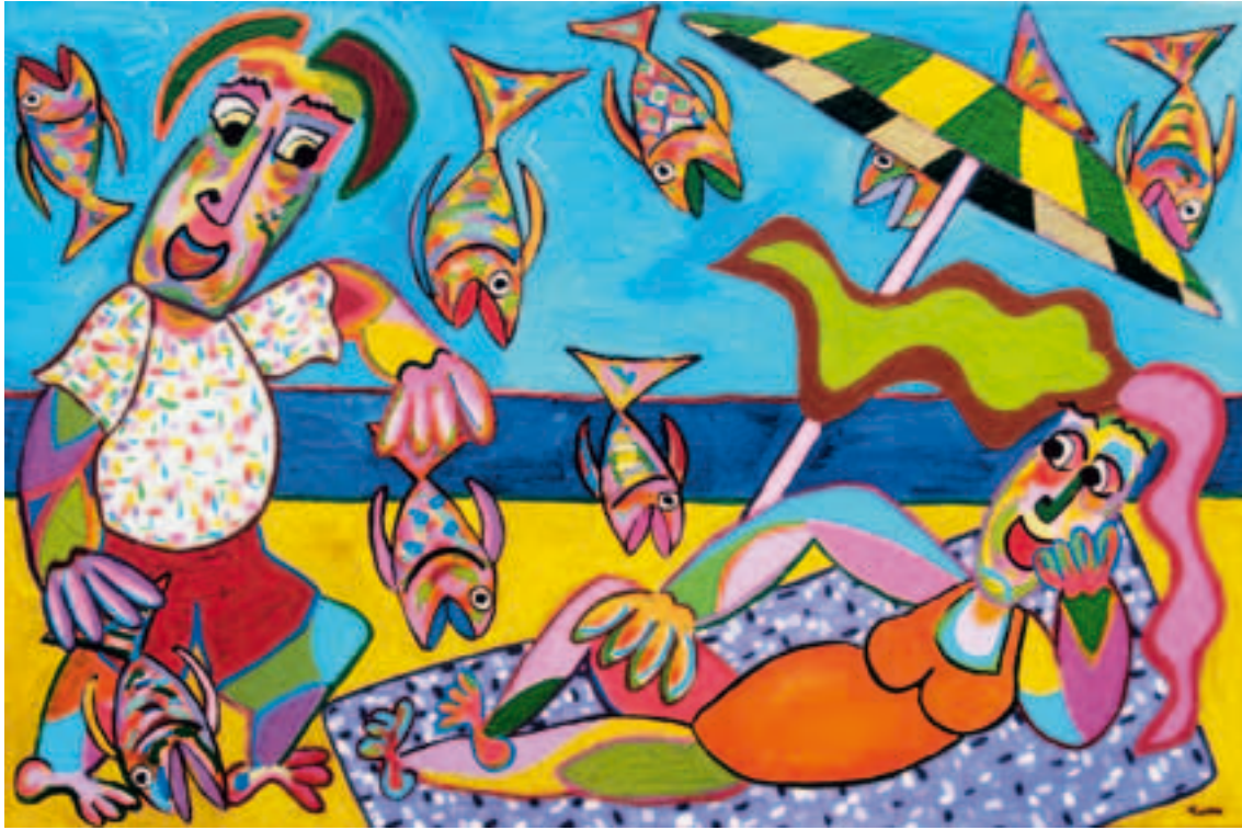
Twan de Vos Etenstijd (acryl op linnen - 80 x 120 cm)

1 _____ 2 _____ 3 _____ 4 _____ 5 _____ 6 _____ 7 _____ 8 _____ 9 _____ 10 _____ 11 _____