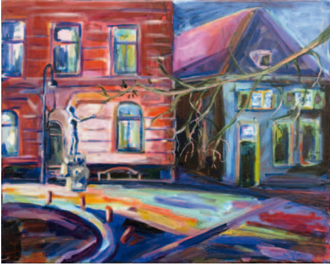
Anja van Rennes 5 Meiplein (acryl - 40 x 50 cm)