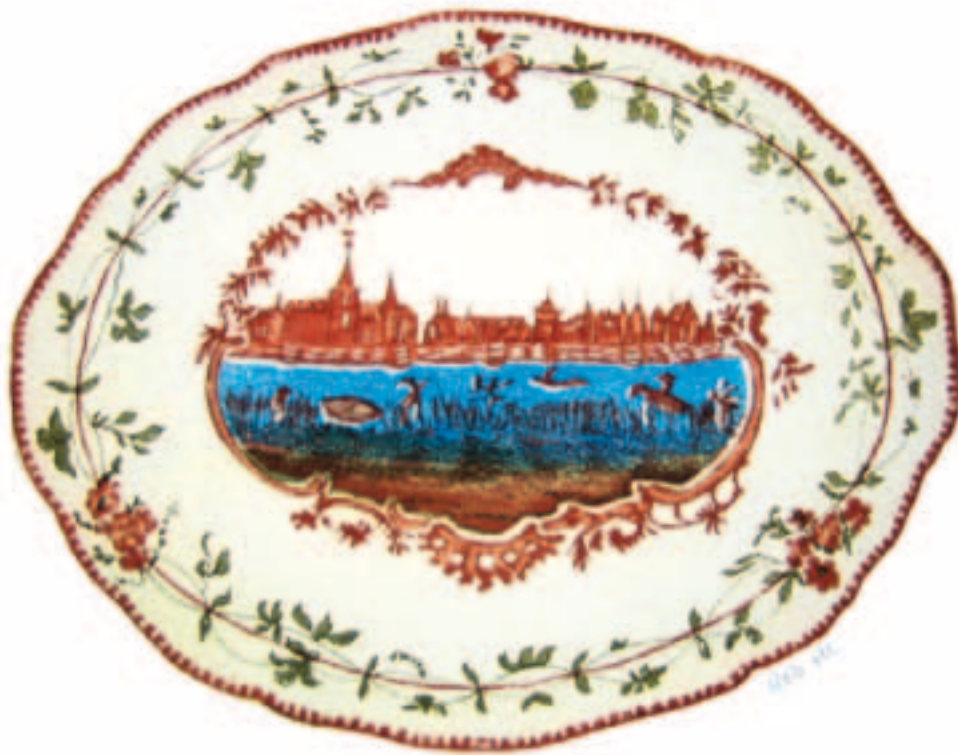
Hanke Cannegieter Schaal met 'gezicht op Wageningen' (kleurets - 19 x 24 cm)